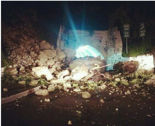
Sendal Tunnel exit blocked by fallen rocks.

September, 2014 had 193.5mm of rainfall and is the fifth highest amount on record. It was also 247.75% more than that of 2013's 78.1mm and 45.38% or 60.4mm more than the Long Term Average (LTA) of 133.1mm. A total of 134.6mm of rainfall fell between the 18 th and 23 rd of the month. This was as a result of the passage of a few Tropical Waves coupled with some Low to Mid-Level moisture surge bringing about numerous convection, producing scattered to moderate showers and thundershowers. Very significant 24hour rainfall amounts of 28.6mm, 35.3mm, 14.3mm, 55.0mm and 30.0mm were recorded on the 10 th , 18 th , 19 th , 21 st and 23 rd respectively. These events contributed greatly to flooding and even landslides in many parts of the country. See photos below