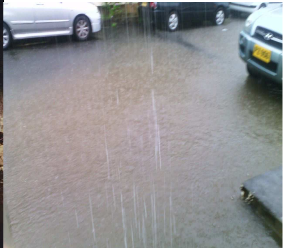
National College School compound flooded