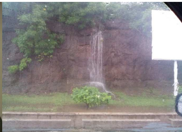
Waterfall formed after heavy rainfall in front of the Airport